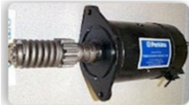
Figure 2 Lucas 2 Bolt Starter

The above is the New style Delphi Starter Motor to Replace the Old Lucas 2 bolt mount starter, mainly seen on early models of the Perkins 4.108 and 4.107.