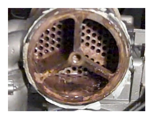
After closed loop flush using Bright Bay's Hammerhead Marine Descaler