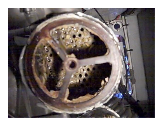
Fouled Heat Exchanger